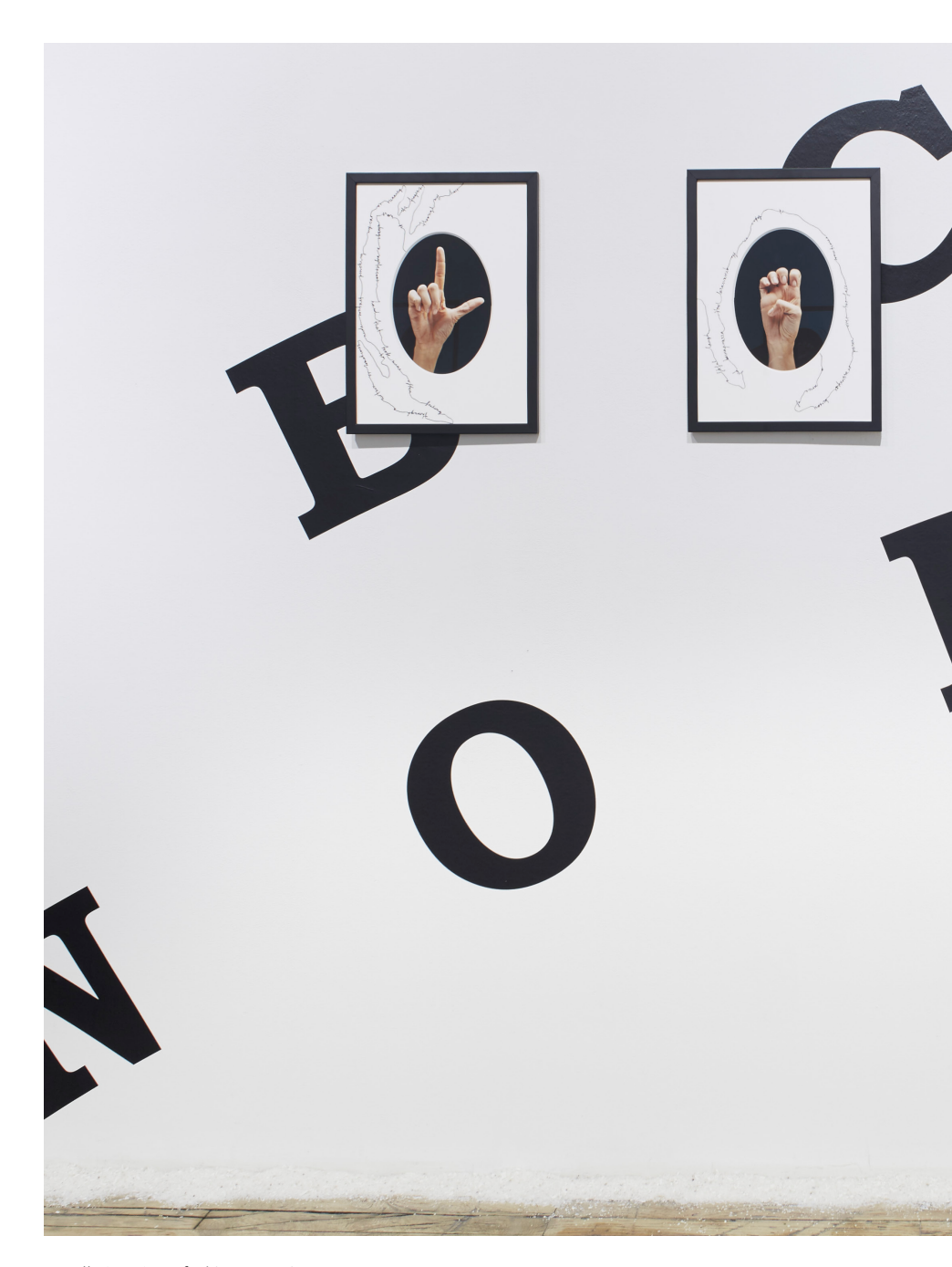
Installation view of Chiara Fumai: LESS LIGHT , 2019.