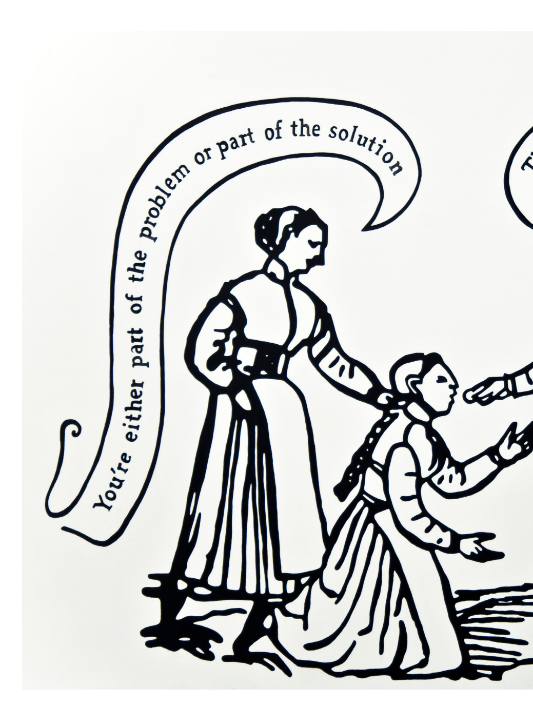
Chiara Fumai, I Did Not Say or Mean 'Warning' (detail), 2013, wall drawing, performance document, text by Anonymous Woman, 78 × 131 in. (200 × 332 cm)