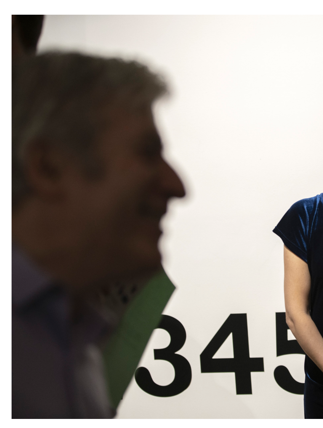
The S.C.U.M. Elite, 2019, as performed in the exhibition Chiara Fumai: LESS LIGHT.