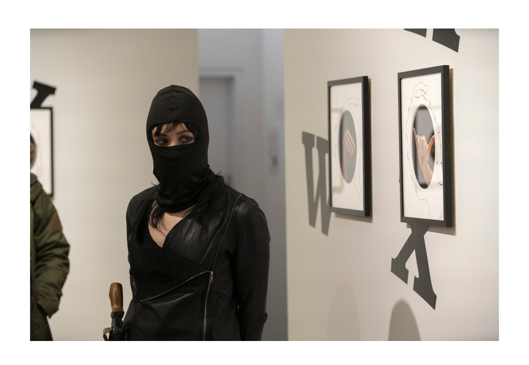
The S.C.U.M. Elite, 2019, as performed in the exhibition Chiara Fumai: LESS LIGHT.